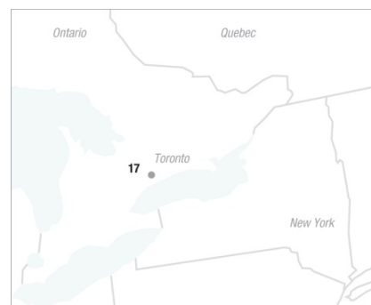
Gas Distribution 17 Greater Toronto Area Project

In September 2012, EGD announced plans to expand its natural gas distribution system in the Greater Toronto Area (GTA) to meet the demands of growth and continue the safe and reliable delivery of natural gas to current and future customers. At an expected cost of approximately $0.6 billion, the proposed GTA project will consist of two segments of pipeline and related facilities to upgrade the existing distribution system that delivers natural gas to several municipalities in Ontario. In December 2012, the Company filed an application with the Ontario Energy Board (OEB), and, subject to OEB approval, construction is targeted to start in 2014, with completion expected by the end of 2015.