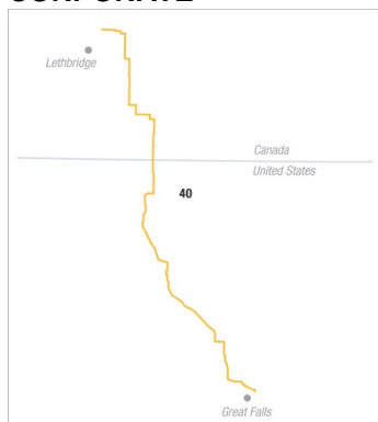
Corporate 40 Montana-Alberta Tie-Line